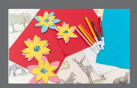
If you'd like to keep up to date with all of our activities and holiday celebrations, consider giving our housebook page a like and a follow.

For hobbies I love my summer holidays and spending time with my dog, Sky.